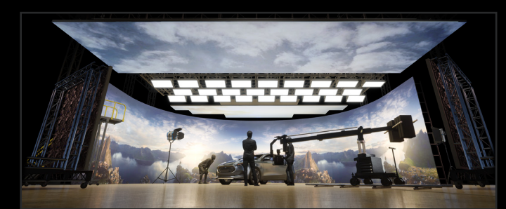
Partial Ceiling + lighting